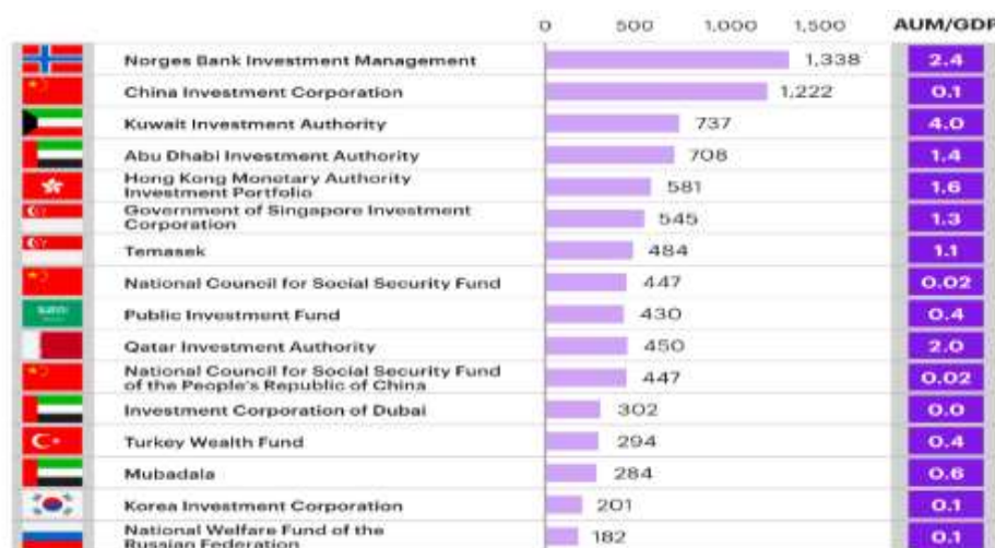
Figure 2 The largest SWFs in the world by assets under management (USD billion)

Notes: SWF is sovereign wealth fund. AUM is assets under management.